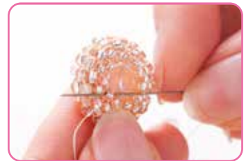
Design by Satoko Nakamura

③ The tip is slightly rounded to avoid splitting the thread. The fine needle can smoothly pierce through a narrow clearance among stitches.