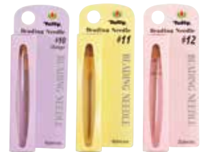
TBN-001e TBN-003e TBN-004e