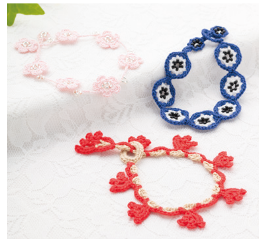
Finished size: Length 22cm

We hope you will enjoy this lace crochet kit, focusing your thoughts on the traditional Turkish handicraft of oya.