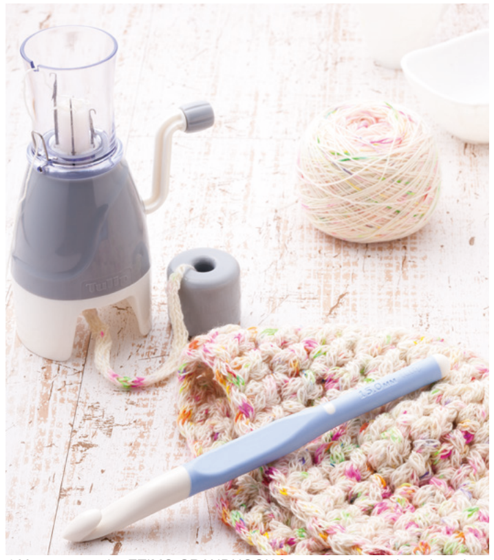
* You can use the ETIMO GRANDHOOK for crocheting the i-cord produced by the i-cord KNITTER(p.79).