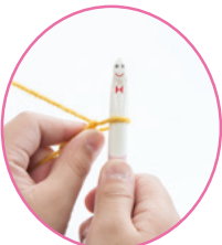
Bringing the loop of the yarn below the bow tie ♪