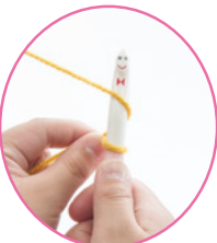
The head ♪

< Points for Usage > You can crochet smoothly when Grand-chan and you can see each other.