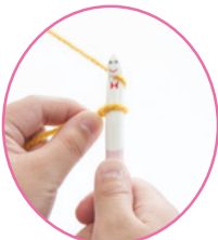
The neck ♪