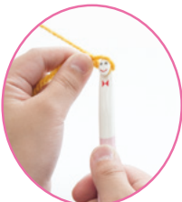
Passing the head through, then... ♪